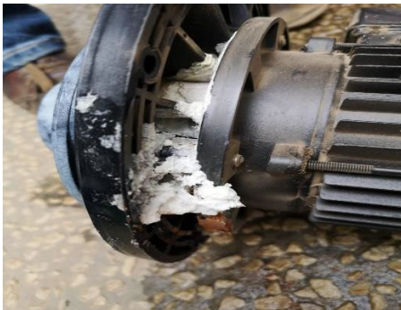
Chemical build up on a pump