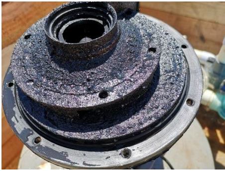
Corroded pump parts