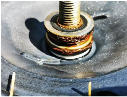
Corroded and rusted shaft seal for a pump